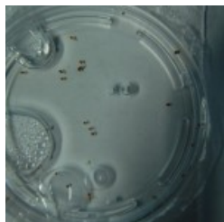
2 MONTH OLD D2O SAMPLE