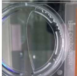
DI WATER NO SEEDS

I'm leaning towards doing this trial for 2 more days because all the seeds are at/approaching max germination. Beyond day 15 I'll keep my eye on the D2O sample to see if there is any sprouting, but it looks like it is becoming a race against evaporation.