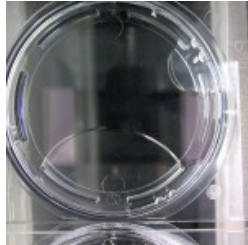
NO SEEDS DI WATER

Nothing new to report. It looks like the 99% D 2 O seeds still haven't sprouted which is what should happen (contrary to Crumley's report). Everything else is growing as expected. And as usual there is nothing in the sample with no seeds.