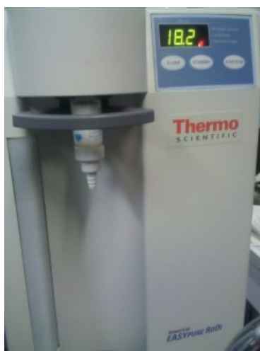
BARNSTEAD EASYPURE RODI

The DI water comes from a Barnstead EasyPure RoDI filtration system from Thermo Scientific, with part number D13321. I took a picture of ours for your viewing pleasure below.