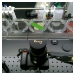
ANOTHER VIEW OF THE SETUP