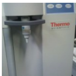
BARNSTEAD EASYPURE RODI

Update: I forgot to mention where the water comes from! It is very easy to overlook that fact since water is the most used chemical in the lab. When Koch talks about setting up osmotic pressure experiments he always mentions that water is the most overlooked variable because it is everywhere and we take it's effect on the experimental world for granted. Anyways: