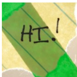
TEST IMAGE AT CLOSEST ZOOM