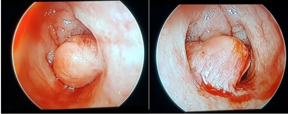
(Fig. 1: Diagnostic endoscopic examination showing the mass)

Patient was advised Computed Tomography paranasal sinus (CT PNS) which showed presence of fairly large lobulated (3x2x2 cm) predominantly fat density lesion situated over the soft palate and projecting into the nasopharynx causing significant nasopharyngeal obstruction. (Fig. 2)