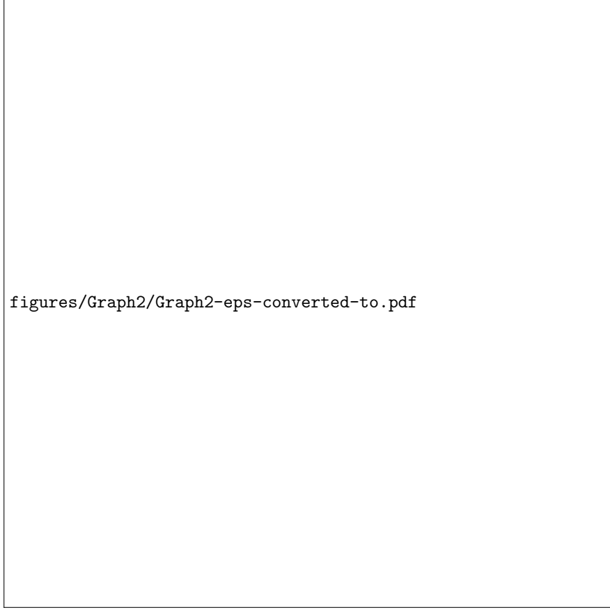
Figure 2: \beta is perpendicular to wave propagation \mathbf{k} in frame F . The left column shows the wave train and corresponding fields \mathbf{E}, \mathbf{B} in frame F , the right column shows the wave train and corresponding fields \mathbf{E}', \mathbf{B}' in frame F' . Note that the direction of wave propagation and Poynting vector differs in the two frames.