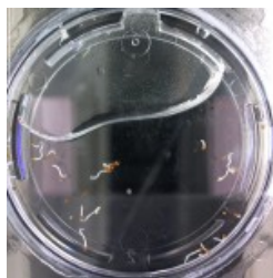
33% D 2 O