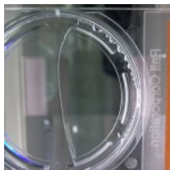
DI WATER NO SEEDS

I'm leaning towards doing this trial for 2 more days because all the seeds are at/approaching max germination. Beyond day 15 I'll keep my eye on the D2O sample to see if there is any sprouting, but it looks like it is becoming a race against evaporation.