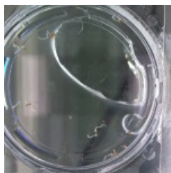
33% D 2 O