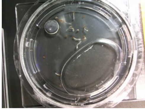
33% D2O FROM TRIAL 1 (SEE FUZZ NEAR TOP)

Now you see, this last picture isn't conclusive that it is in fact mold, but the reason I think it is is because the density of "cloud" is way thicker than in any of the root hair samples in a shorter amount of time. In a strange twist, this piece of evidence also occurs in the 33% D2O sample from RC1. I'm positive this also happened in one of the samples from Trial 3 as well, but I have no proof of the matter (and also possibly in the 33% D2O sample).