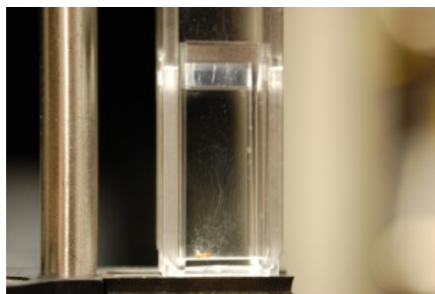
PRESOAKED DARK VIRGINIA IN DDW