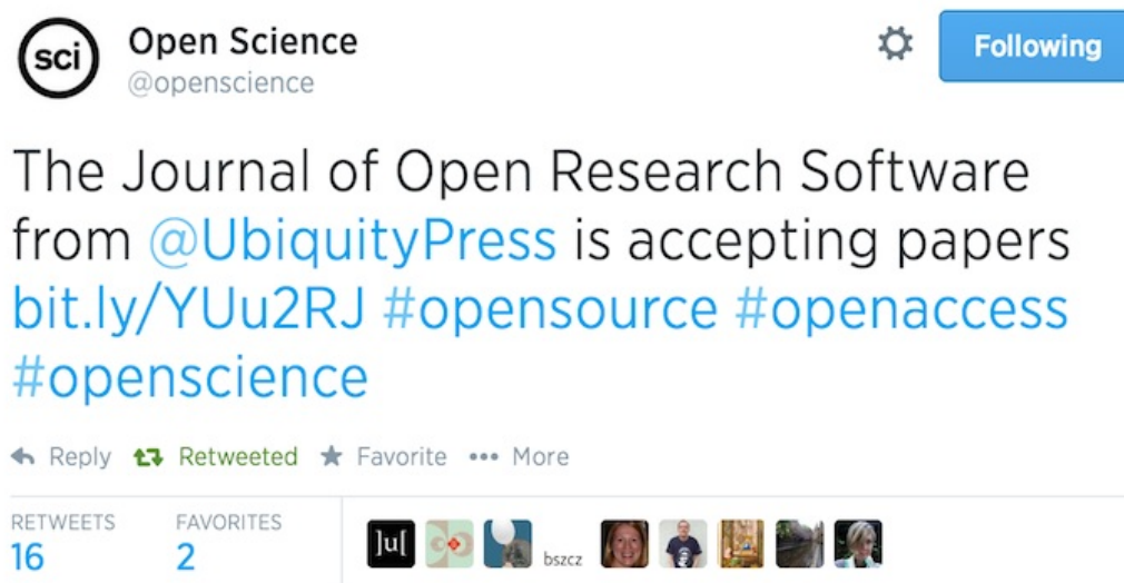
Figure 2 Screenshot of a tweet sent by the @openscience announcing JORS call for papers.

On 2013-03-29, the tweet represented in Figure 2 was posted by the @openscience Twitter account.